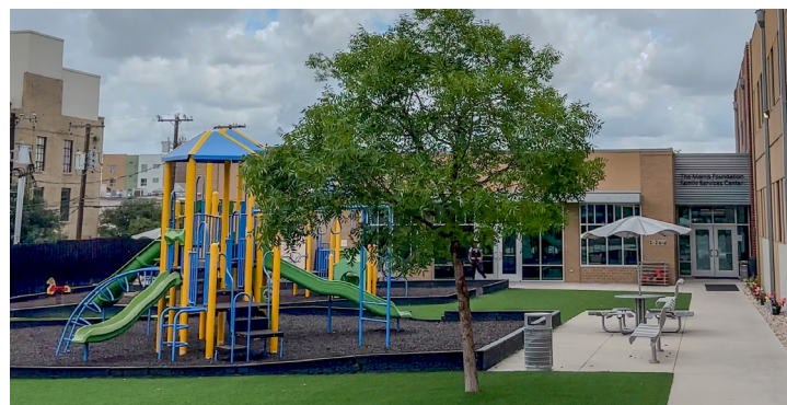
Children have a safe and spacious playground for lots of fun activities.