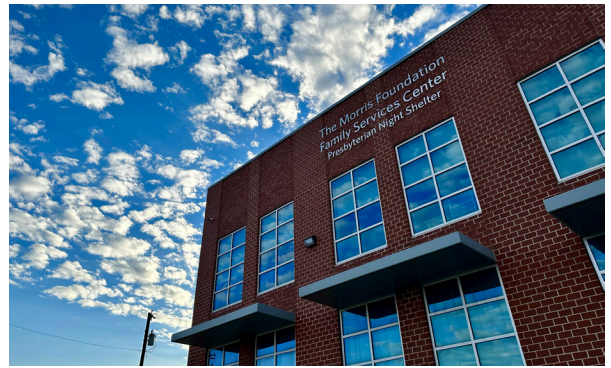
The Morris Foundation Family Services Center accommodates 40 families who are on the path to exiting homelessness.