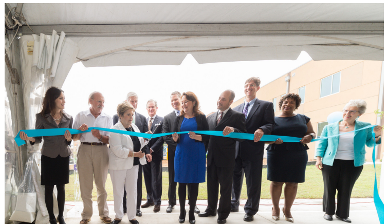
A ribbon cutting celebrated the new Women and Children’s center, later named The Morris Foundation Family Services Center, on June 6, 2016.

Thanks to the generosity of so many donors at varying levels, a brand-new building was constructed several blocks away, providing space for 40 families, along with case management and other supportive services. The facility boasts a large playground area for kids, protected by a metal privacy fence for safety and security. There are common family rooms for activities and TV viewing, a colorful dining room, lots of books and reading corners. Plus, there are tons of activities for the children, provided by both staff and a host of volunteers.