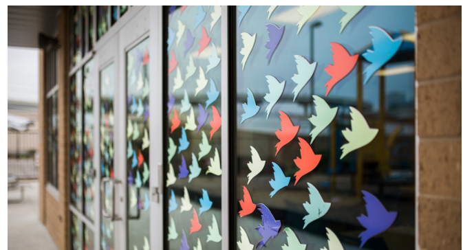
Colorful birds graced the windows and entrance to the center on its opening day.