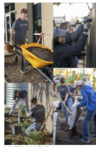
Lockheed Martin

Registration has begun for our upcoming Day of Service sponsored by Lockheed Martin. Join with others in the community as we tackle some of the many projects around Patriot House. Then, after a morning of hard work, we will honor our Veterans with a flag ceremony. We hope you'll join us! Click the image below to register.